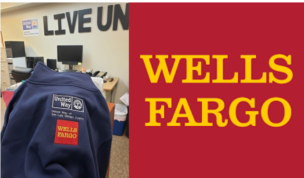
Youth Board is sponsored by a generous grant from Wells Fargo Bank, NA

The Youth Board serves as a student-led Board of Directors. Members learn about and discuss community needs, volunteer within the county, and fundraise for their grant fund. Guest speakers who have knowledge of community needs often share at meetings. This also provides an opportunity for students to meet diverse leaders and contributors in the county and to partner with them on projects such as